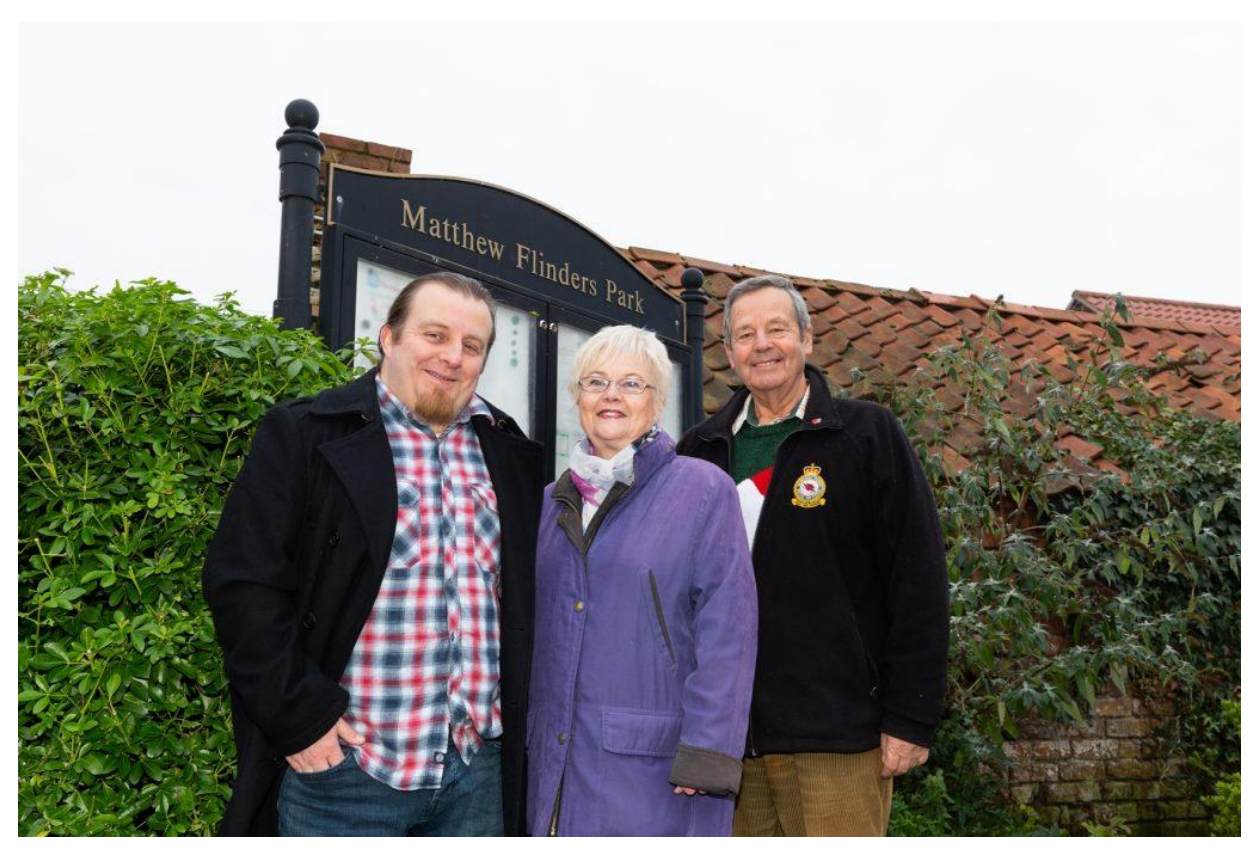
Improving Donington's Environment for All, Donington

2 Awards: November 2018 - £5,940, June 2019 - £15,000